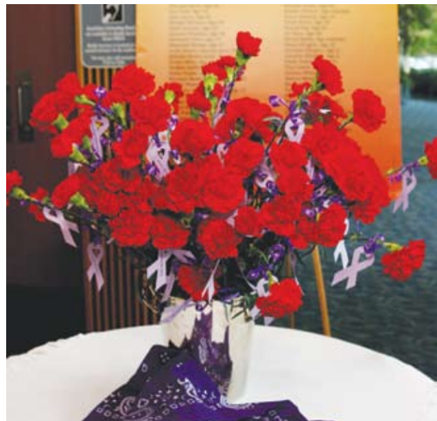
These flowers, each representing a victim who was killed last year, were part of the Remember My Name ceremony at the speak-out. The ages of the victims ranged from 1 to 70.