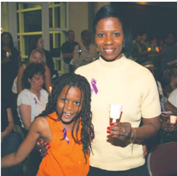
Former PADV client and her daughter celebrate their courage and new life free from violence.